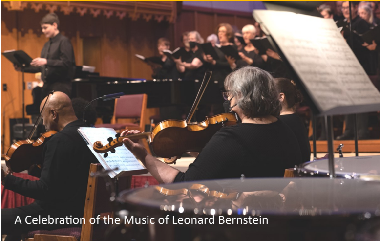
A Celebration of the Music of Leonard Bernstein

The Chris Hall Fund, the A.M. Music Fund, and the Concert Fund all provide resources to support incredible music ministry, including special events like A Celebration of the Music of Leonard Bernstein.