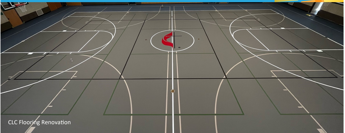
CLC Flooring Renovation