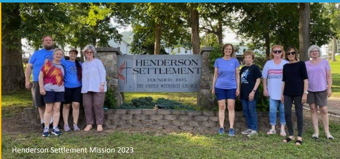
Henderson Settlement Mission 2023

Three active Named Funds – the Drinkard, Hermann, and Kernan Funds – provide financial support for missions and ministries locally and around the world. These funds are making a positive difference in lives of persons in Detroit (Brightmoor Community), Kentucky (Henderson Settlement), Tennessee (Sneedville), Haiti, India, and Czech Republic.