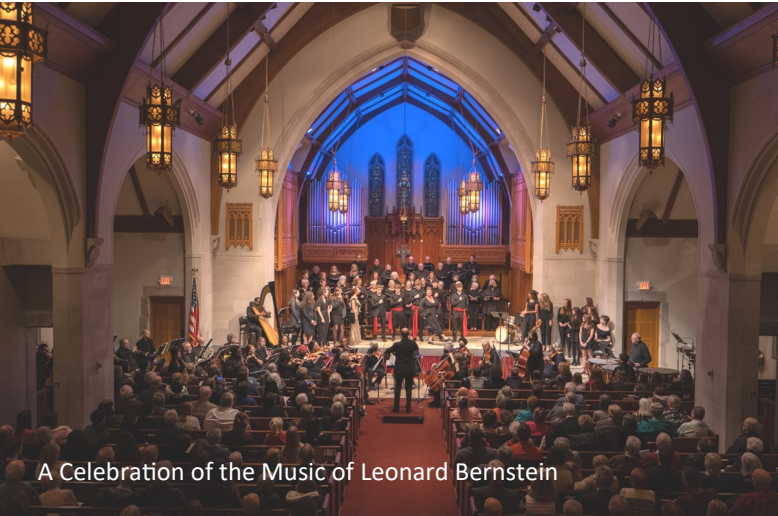
A Celebration of the Music of Leonard Bernstein