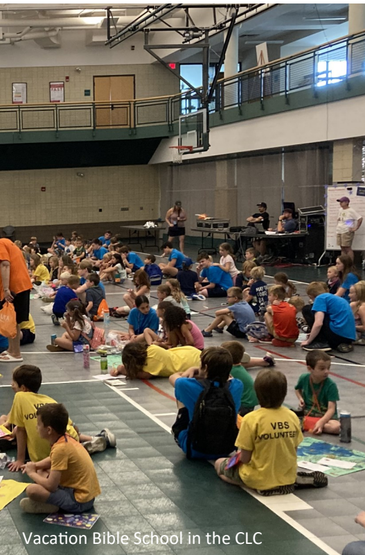
Vacation Bible School in the CLC