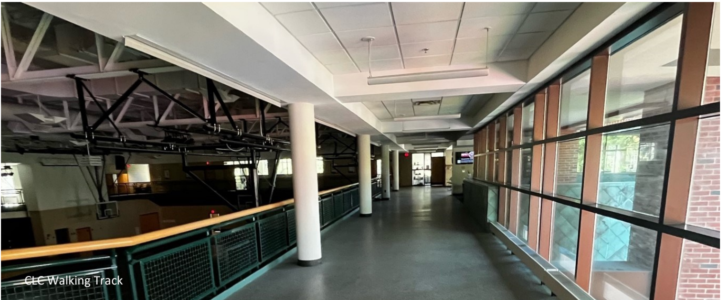
CLC Walking Track

A grant from our General Endowment was critical to reopening our Christian Life Center. A second grant is underwriting the purchase of equipment for Pickleball in the CLC.